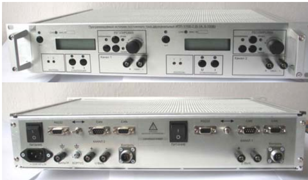
Picture.1. Power supply “Marathon IPP-1/100” – 2 channels, front and rear view.

The first mode is used in stand alone mode and in lab. The second and the third modes are used for computerized control. The second is used to control a few power supplies simultaneously, while the third mode is used to make distributed multi-channel systems with up to 200 power supplies in one network node. Advanced front panel with LCD indicator and digital encoder gives access to all features of the power supply in manual mode.