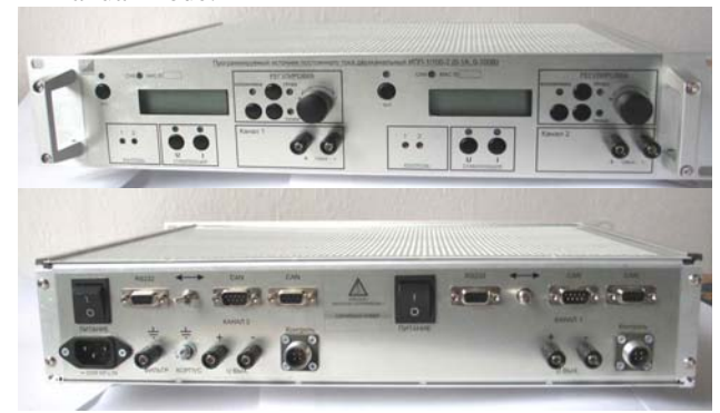
Picture.1. Power supply "Marathon IPP-1/100" – 2 channels, front and rear view.

The first mode is used in stand alone mode and in lab. The second and the third modes are used for computerized control. The second is used to control a few power supplies simultaneously, while the third mode is used to make distributed multi-channel systems with up to 200 power supplies in one network node. Advanced front panel with LCD indicator and digital encoder gives access to all features of the power supply in manual mode.